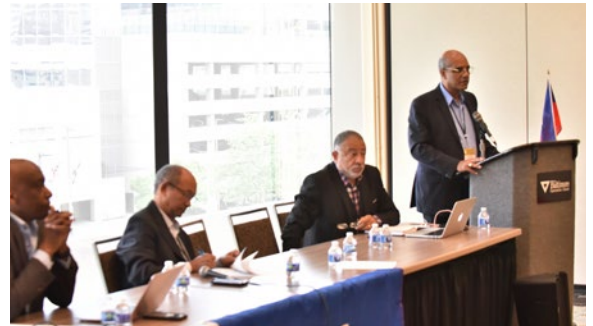
Day 4 of SOBWCV: Crisis in Haiti session

The Haiti Support Project is an arm of the Institute of the Black World which is committed to building a constituency for Haiti among African Americans to collaborate with Haitians to advance democracy and development in the First Black Republic. As an outcome of the Special Session on Haiti, the Haiti Support Project (HSP) is committed to collaborating with the Haitian American Foundation for Democracy to mobilize/organize a formidable coalition in the U.S. in support of the Montana Accord Movement as the inclusive, comprehensive, people-based movement which offers the greatest promise for resolving the current crisis and advancing a process to create an authentic Haiti-based democracy and sustainable development in the First Black Republic.