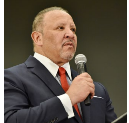
Day 2 of SOBWCV: Marc Morial

Addressing the same Town Hall Meeting, Marc Morial , President/CEO of the National Urban League, applauded IBW for consistently gathering the ecosystem of civil rights/human rights organizations in Black America and the Pan African world to address issues of vital concern to Black people. In a passionate pre-