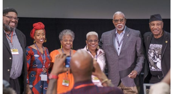
Day 2 of SOBWCV

Abolishing the criminal injustice system in the U.S., including ending the War on Drugs in all of its insidious vestiges, is a major priority for IBW. Consistent with this goal, under the leadership of Ronald Hampton , one of the world's leading experts and advocates on these issues, IBW convened two major National/International Symposia on Reimagining Public Safety and Law Enforcement in 2022. The results of these very productive Symposia were the centerpiece of the Plenary and Working Sessions on these issues at the Conference. With the input of participants at the Conference, IBW is prepared to move forward with the creation of a National Network and Resource Center and National Police Justice and Accountability Task Force to provide assistance to local communities to develop and implement new paradigms of public safety and law enforcement. IBW will also utilize the composite of best practices derived from the Symposia and sessions at the conference to establish one or more models of community-based, community-controlled public safety and law enforcement working at the behest of residents, community-based organizations and agencies. A neighborhood in Washington, D.C. will be selected for the first pilot.