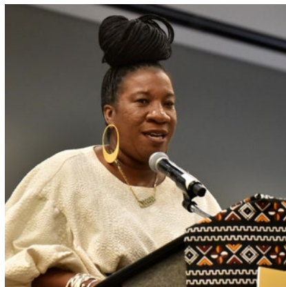
Day 5 of SOBWCV: Tarana Burke

Maurice Mitchell called on organized labor to vigorously confront organized capital with independent political power. He described the Working Families Party as a multi-racial political vehicle solidly based among Black people and people of color; a multifaceted Party that is committed to utilizing all phases of political power including protests, advocacy, institutional development and electoral politics.