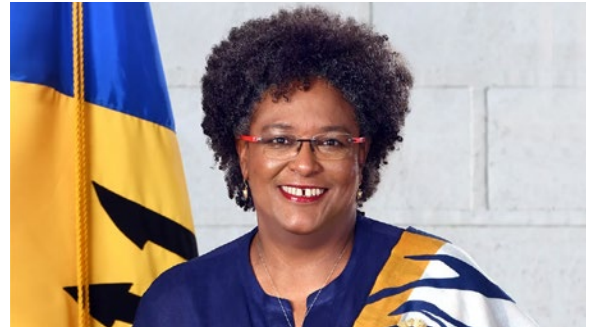
Hon. Mia Mottley

IBW commends Hon. Mia Mottley , the first woman Prime Minister of Barbados and a recipient of the Legacy Award, for her bold leadership in promoting South to South relationships, reaching out to African heads of state and the African Union to encourage more vigorous engagement in the global reparations movement and demanding major reforms of western dominated financial institutions like the World Bank and International Monetary Fund. PM Mottley has also called for a Global Reparations Summit to maximize coordination between the various regional and national reparations commissions.