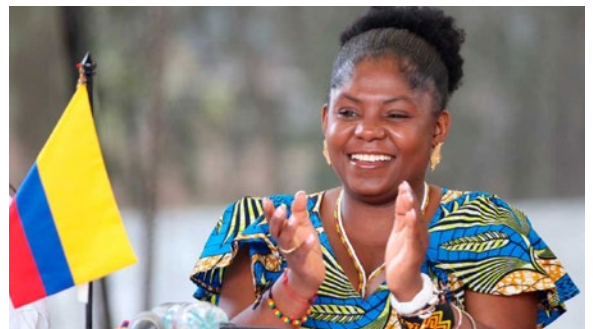
Vicepresidenta Francia Márquez