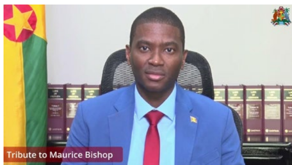
Prime Minister Dickon Mitchell

Tragically, Bishop was executed by dissident elements who imprisoned him after an attempt to seize power. The coup attempt and execution of Prime Minister Maurice Bishop was the pretext for the U.S. invasion of Grenada to crush the revolution. These tragic events marked a set-up for progressive, revolutionary forces and Grenada lost its place as a leading force for progressive change in the world.