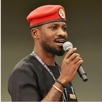
Day 2 of SOBWCV: Bobi Wine

the most recent presidential election by a landslide. Bobi Wine is the personification of global Africans rising up to challenge and remove neo-colonial leaders from the path towards genuine African liberation! Participants of SOBWCV likely witnessed a brilliant address by the future President of Uganda!