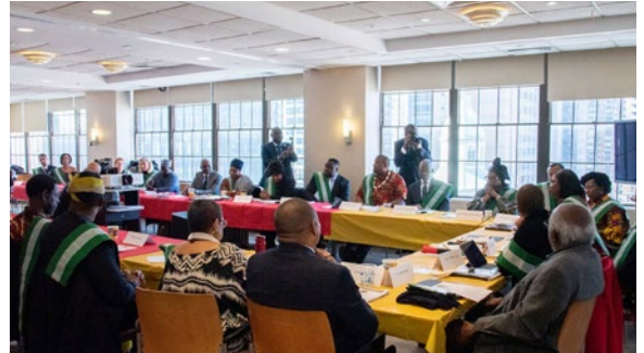
February 22, 2020 Pan African Unity Dialogue Meeting.

The growing diversity of Black America with an infusion of millions of immigrants from Africa, the Caribbean and Afro-Descendants from Central and South America demands that we find ways to work together to enhance the collective power of people of African descent, Black people in the U.S. We must not assume that commonality of skin color will automatically translate into unity of purpose and action. National, cultural and ethnic identity are powerful unifying factors among “Black people.” We may live in the same cities without actually working together for the common good. Therefore, IBW advocates that we practice Pan Africanism wherever we reside as people of African descent, including in Black America.