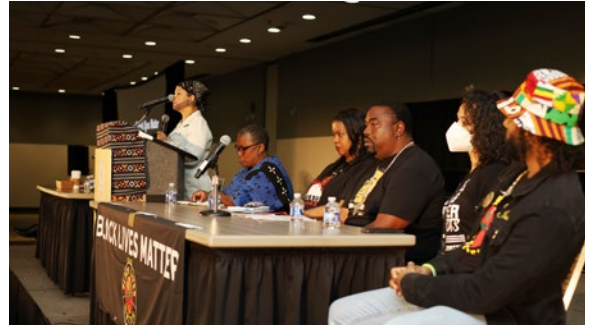
Day 3 of SOBWCV: Making Black Lives Matter session

IBW reaffirms our commitment to support Black Lives Matter Grassroots in its righteous struggle to regain millions of dollars illegally seized from the Black Lives Matter Global Network Foundation by Shalomyah Bowers and the Bowers Consulting Firm. These funds were donated to the Foundation to support BLM Grassroots’ commitment to advance people’s struggles for transformative racial and social justice. These funds should be returned to BLM Grassroots to fulfill the intended mission. IBW stands with BLM Grassroots for this righteous cause.