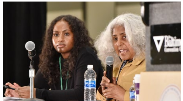
Day 2 of SOBWCV: Environmental Justice session

Environmental justice, global warming, climate change, and clean, accessible and free water must rise to the top of the global agenda for people of African descent. Black people are universally vulnerable and disproportionately impacted by these issues. Therefore, with the concurrence and support of collaborating partners like Corporate Accountability and Corporate Accountability Participation Africa, IBW renews the call for a Global Summit on Water as a Human Right in Jackson, MS in conjunction with Earth Day, 2024. IBW is committed to playing a facilitative role in planning and convening this critically important Summit.