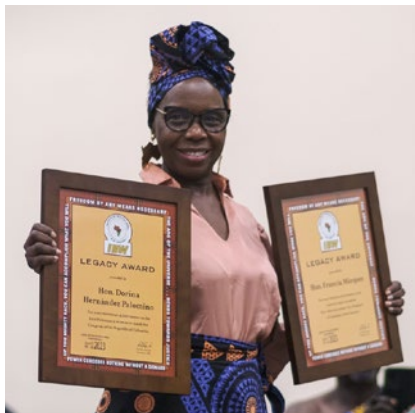
Day 4 of SOBWCV: Sen. Hernandez Palomino

engaging in electoral politics to achieve justice, equality and the resources to secure a better quality of life. However, she emphasized the need for Black people to avoid becoming politicians as usual perpetrating politics as usual. Mayor Shawyn shared that she is really a social worker at heart and carries her people serving, people-based, people-oriented, people-empowering values and commitment with her as a guide to her administration. Electoral politics should be a participatory process where the people not only hold electoral officials accountable, but the people also work with elected officials to formulate and carry-out public policies that affect families and communities.