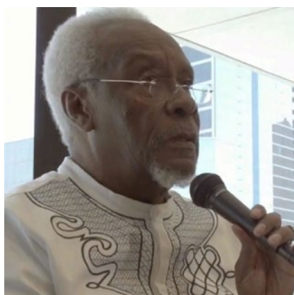
Day 1 of SOBWC V: P.M. Patterson

Hon. P.J. Patterson , the longest serving Prime Minister of Jamaica and a global statesman, opened the Pan African Institute of the Conference with a Keynote Address that was quickly recognized as an historic statement on the redevelopment of post-colonial nations in the Caribbean and Africa. The former P.M. delivered a searing indictment of U.S. and western dominated global financial institutions like the International Monetary Fund and World Bank that intentionally formulate policies that suffocate rather than aid the development of formerly colonized nations in the Black World. P.M. Patterson challenged the Global Black Community to unite and utilize its vast material and human resources to build thriving, sustainable, interdependent nations.