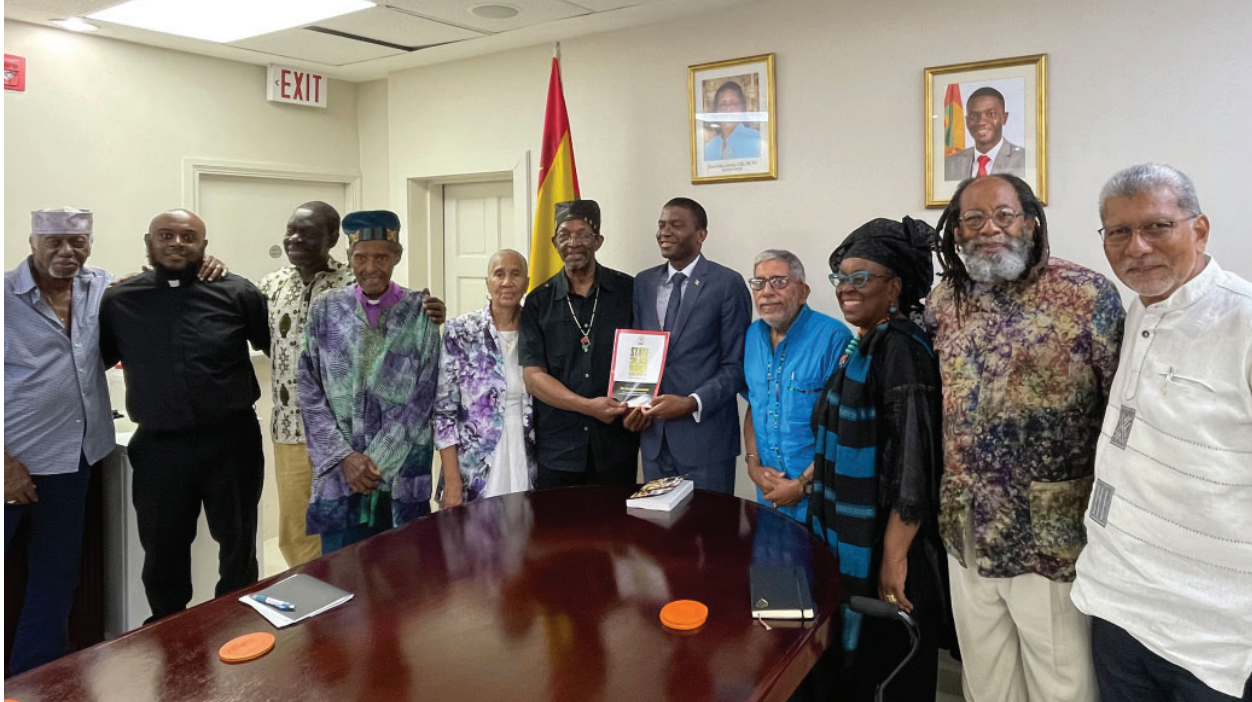
IBW delegation meeting with Grenada PM Dickon Mitchell October 2023