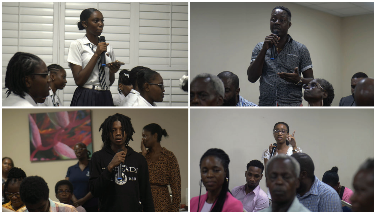
October 2023 - Cross-Generational Discussion

The Cross-Generational Dialogue facilitated by IBW was warmly received and was very impactful. Secondary and university students came well prepared to ask questions about the legacy of Maurice Bishop and the People’s Revolutionary Government in terms of accomplishments and shortcomings of this short-lived period in Grenada’s history. Participants across generations opened-up to share the wounds and pain still plaguing them because of the tragic events of October 19, 1983. They welcomed the opportunity to share their stories