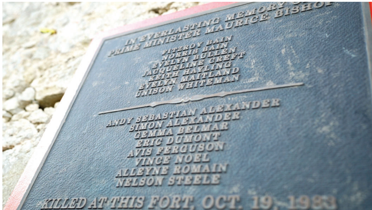
Commemorative plaque for PM Maurice Bishop and his ministers who were executed at Fort George in Grenada on October 19, 1983