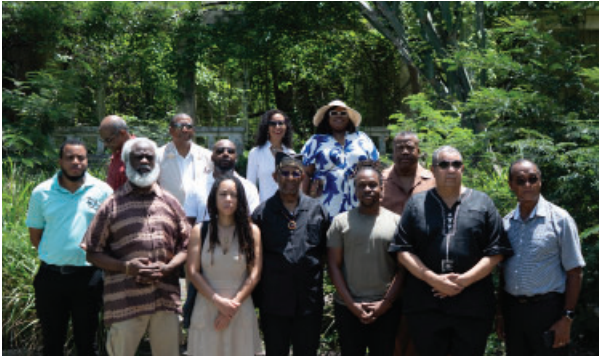
Delegation at remains of Butler’s House