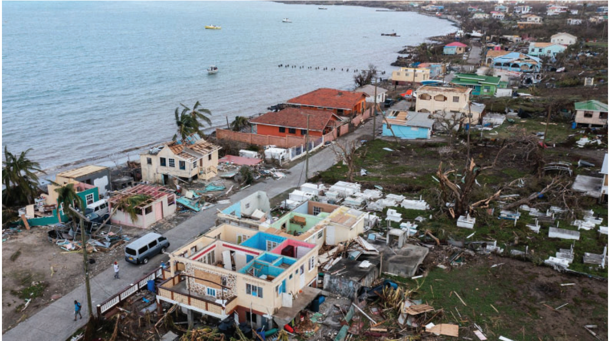
A drones view of Hurricane Beryl damage in Carriacou