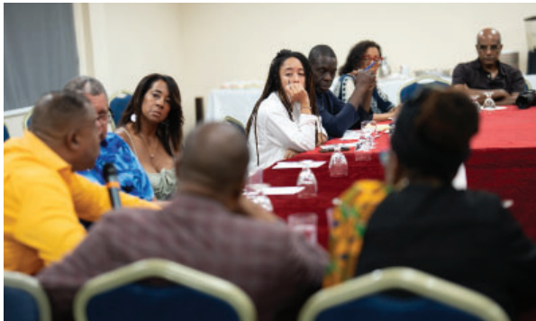
Economic development session