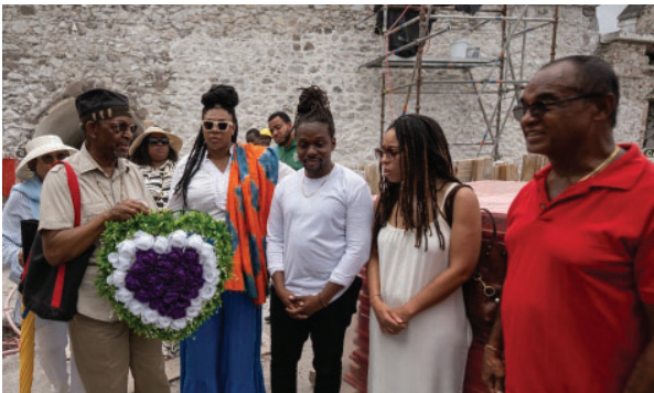
Young leaders in the delegation honoring the memory of the Martyrs through leading placing of roses.