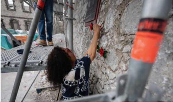
Roses left on the walls of Fort Rupert

The site is being transformed into a historical memorial monument. The Delegation conducted a sacred ceremony on the grounds culminating with younger leaders in the Delegation laying a wreath at the site followed by members of the delegation laying individual flowers. These moving moments set the tone in terms of the importance of preserving the memory of the People’s Revolutionary Government as an inspiration for the potential rebirth of people-based democracy in Grenada.