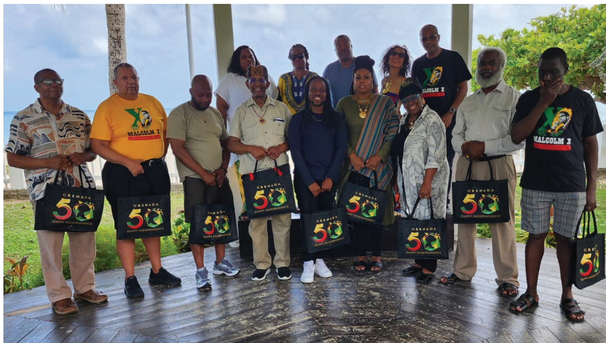
Delegates at the conclusion of a successful pilgrimage to Grenada