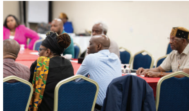
During the session, delegates share expertise and feedback to support suggested initiatives

In a major address during the All Heroes Day commemorative activities, Prime Minister Dickon Mitchell outlined a business/economic development agenda which was characterized by a heavy emphasis on self-sufficiency and self-reliance based on Grenada's human and material assets. His position was refreshing because many Caribbean nations that depend heavily on tourism import commodities to service tourists rather than produce them internally. In addition, overdependence on tourism can result in a neglect of other sectors of the economy. Magnanimously acknowledging the building blocks of his predecessor, PM Dickon Mitchell challenged the people of Grenada to utilize the human and material assets of the nation as the foundation for sustainable development in specific sectors. This charge seemed remarkably compatible with the vision of the Honorable Marcus Mosiah Garvey .