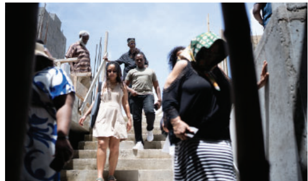
Delegation tours the Maurice Bishop Institute