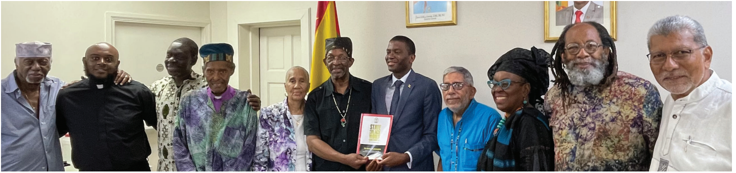
Flashback: IBW delegation meeting with Grenada PM Dickon Mitchell, October 2023