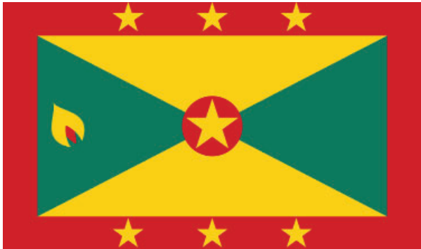
Granadian National flag