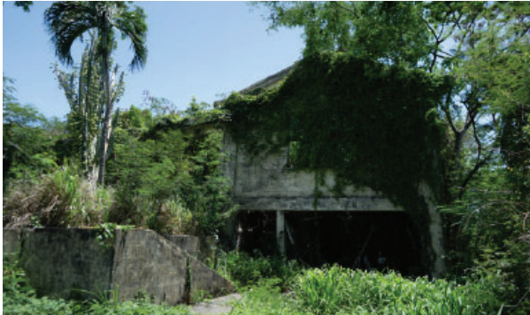
Butler’s House, where Maurice Bishop was under house arrest