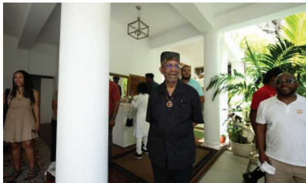
Delegation admiring the thoughtfully curated space for the Maurice Bishop Institute.