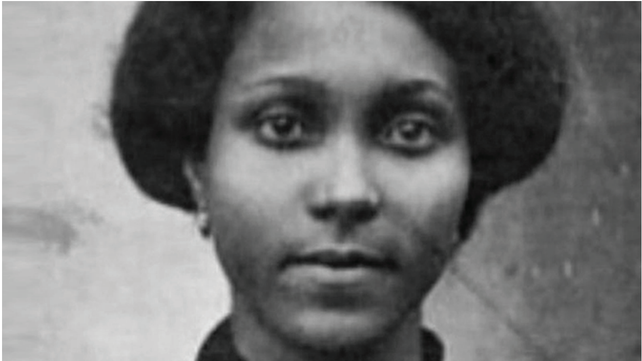
Louise Langdon Little (1897-1991), Grenadian-born American activist and the mother of Malcolm X.