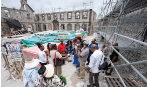
Delegation at Fort Rupert