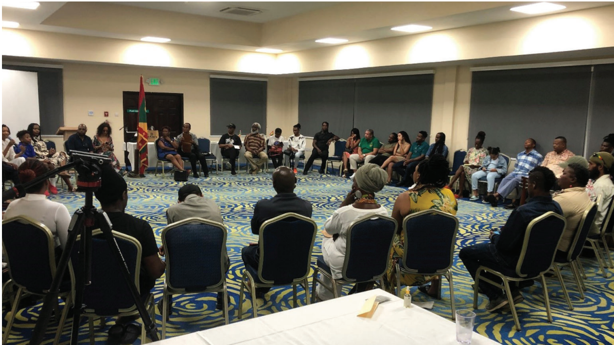
Cross Generational Dialogue with Artistes, Creatives and Culture Workers in Progress