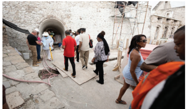
Delegation departing the sacred site.