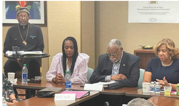
Reimagining Public Safety and Law Enforcement Convening 2022.