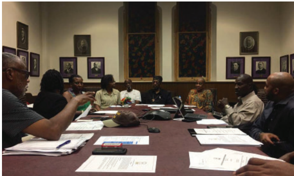
D.C. Justice Collaborative meeting 2017.