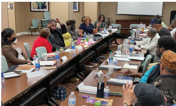
Reimagining Public Safety and Law Enforcement Convening 2022.