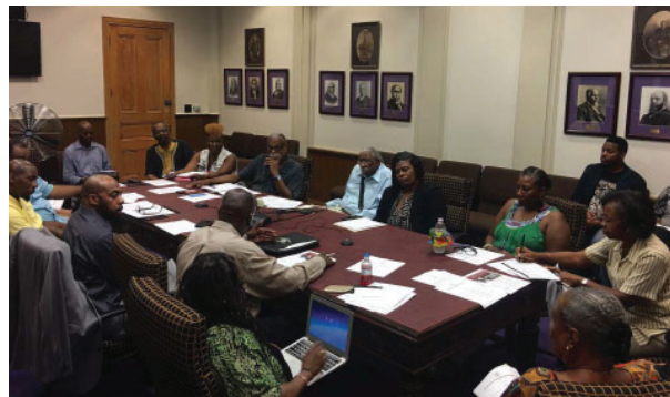
D.C. Justice Collaborative meeting 2017.