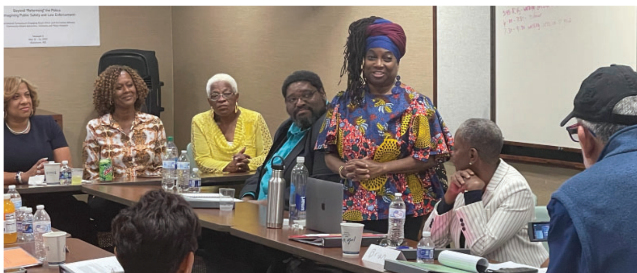
A Round of Introductions; Reimagining Public Safety and Law Enforcement Convening 2022.