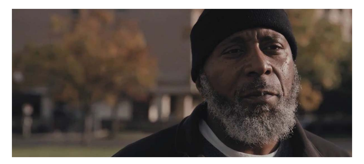
Scene from documentary Returning Citizens