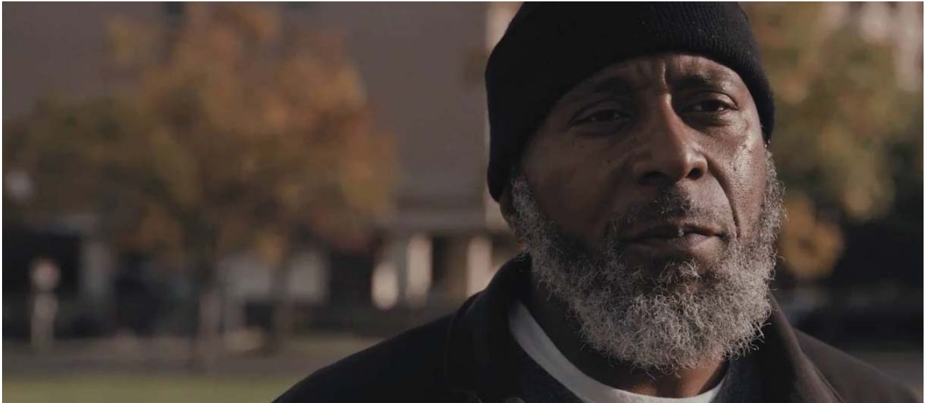
Scene from documentary Returning Citizens