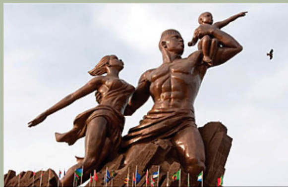
African Renaissance Monument · Dakar, Senegal