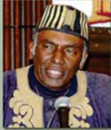
DR. LEONARD JEFFRIES Foremost African-centered scholar/activist

Report Back from the World Festival of Black Arts and Cultures in Senegal with Reflections and Recommendations by