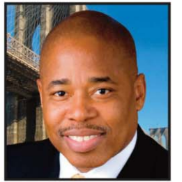
Hon. Eric Adams Brooklyn Borough President